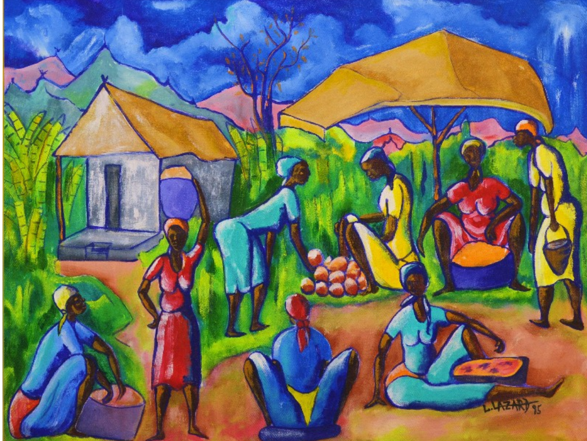
Brightly Colored Haitian Art