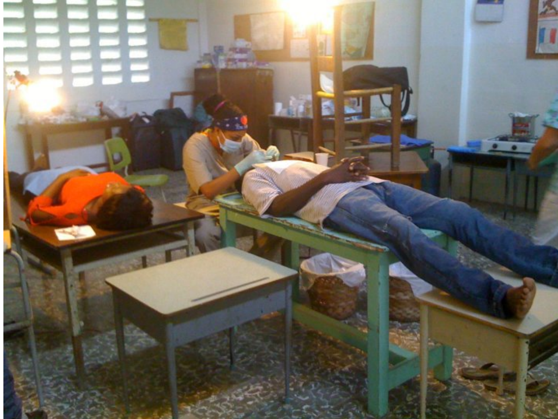
Surgery in the Classroom