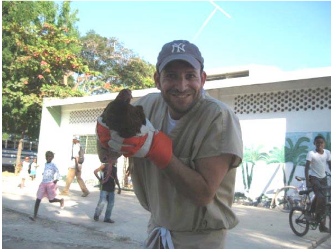
My Friend (and dinner...)