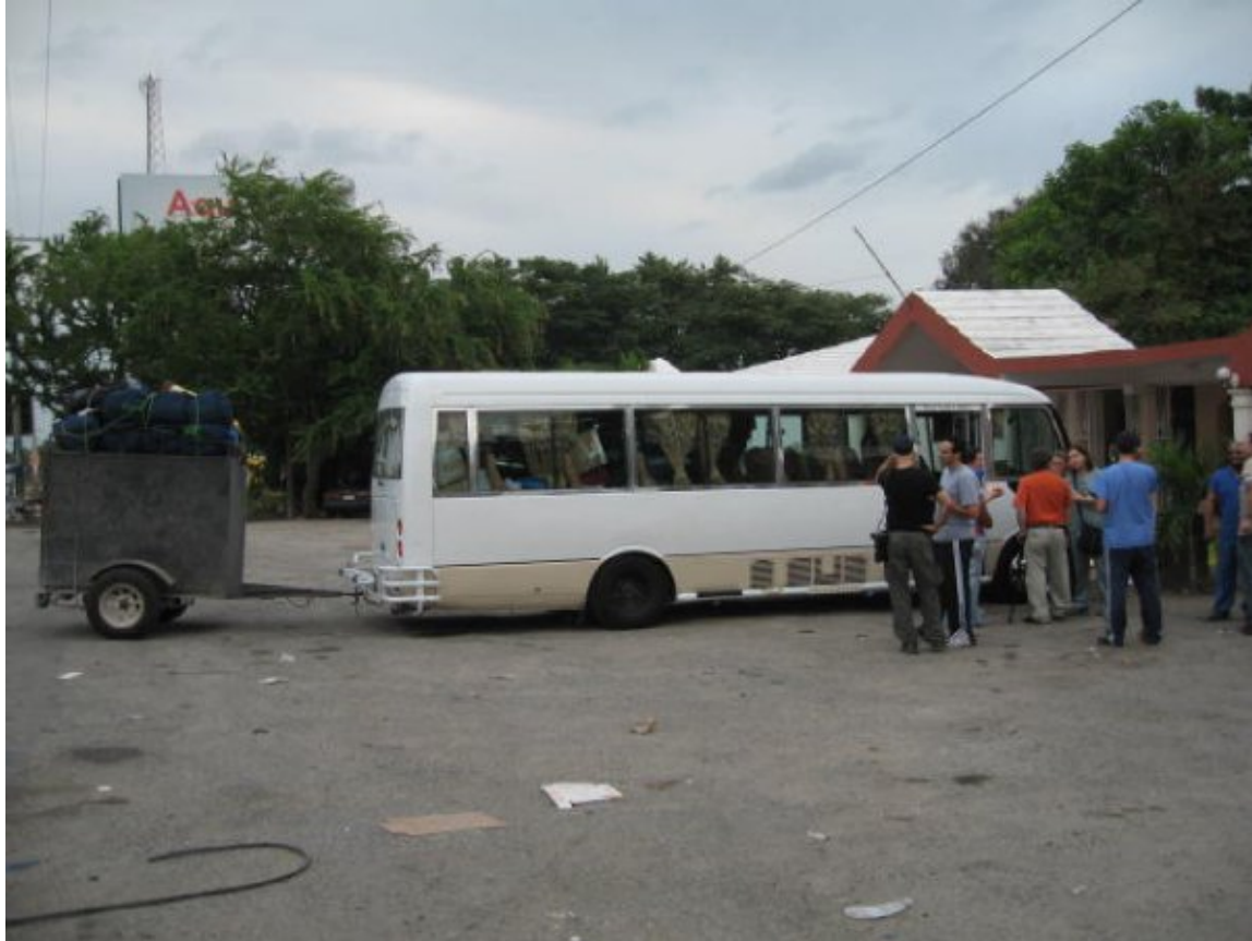
Bus & Trailer with Supplies