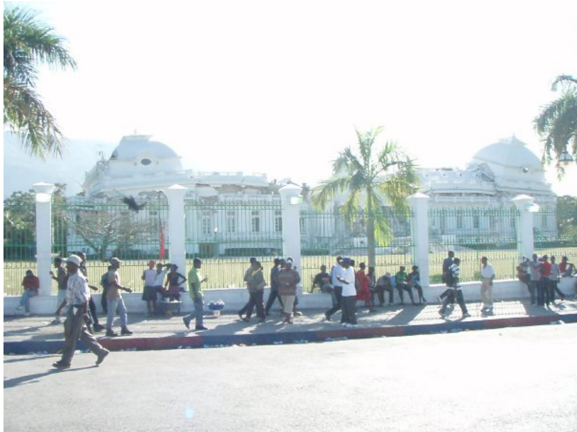
The President's House