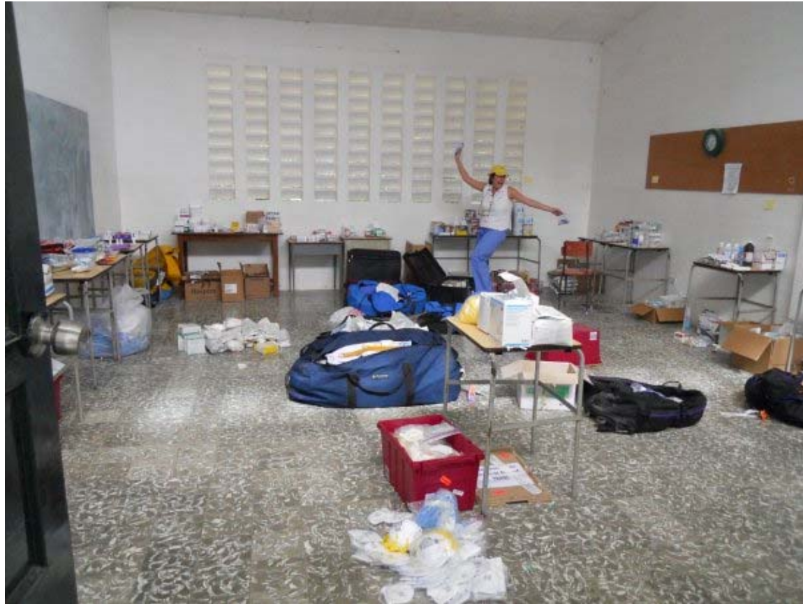
Our Happy Pharmacist before we opened...