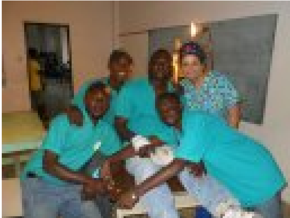
Training the Haitians In Healthcare