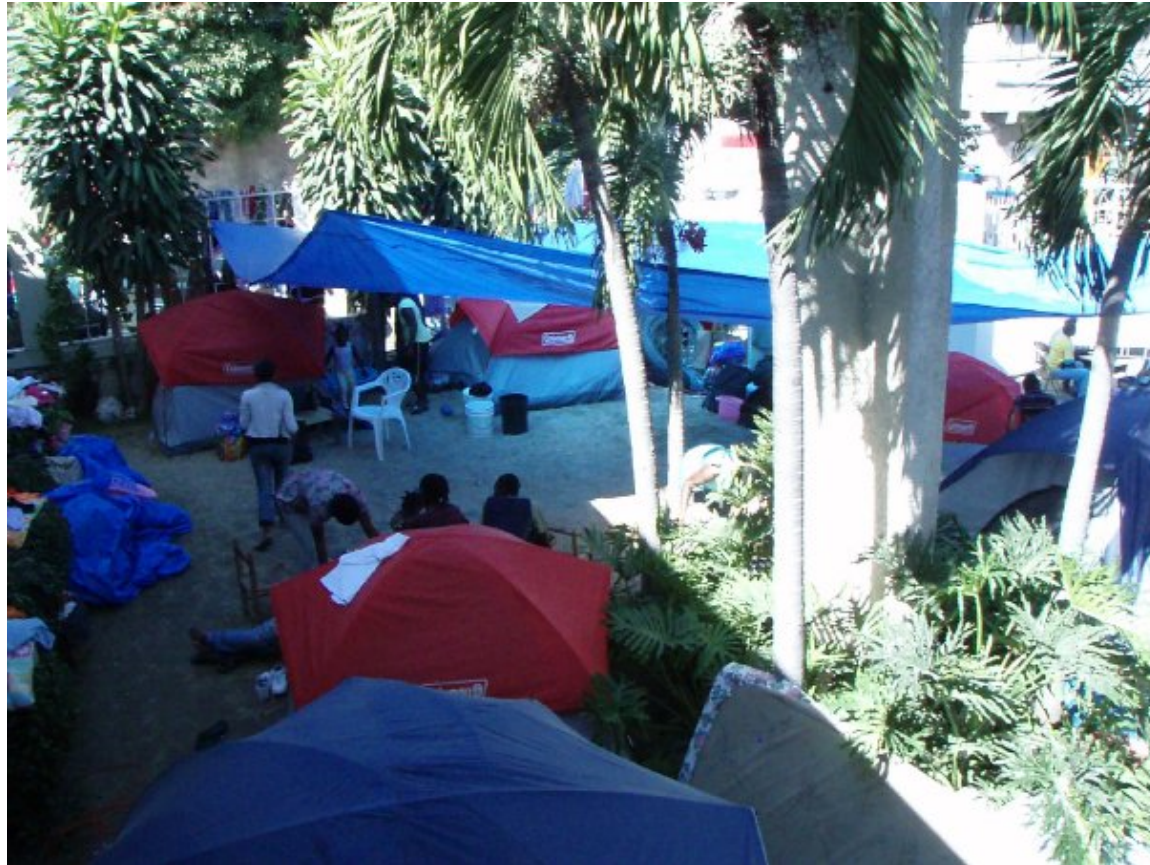
People living in tents & under tarps...