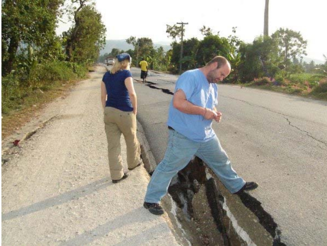
Earthquake Damage to Road