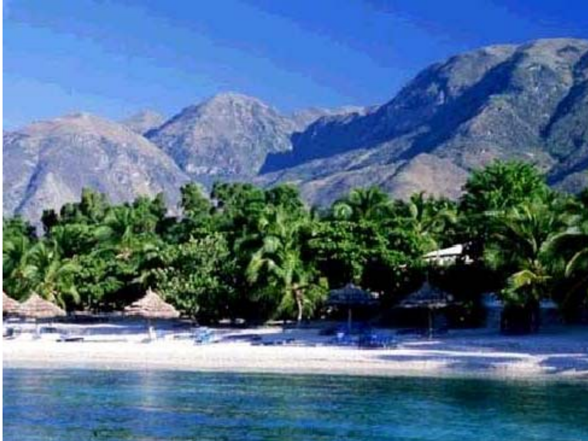
Beautiful Tropical Island