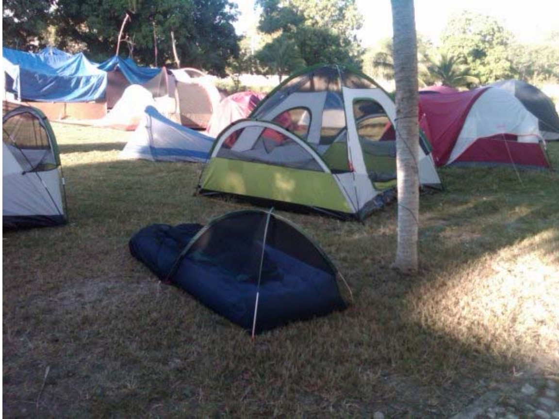
Our Tents on the Soccer Field...