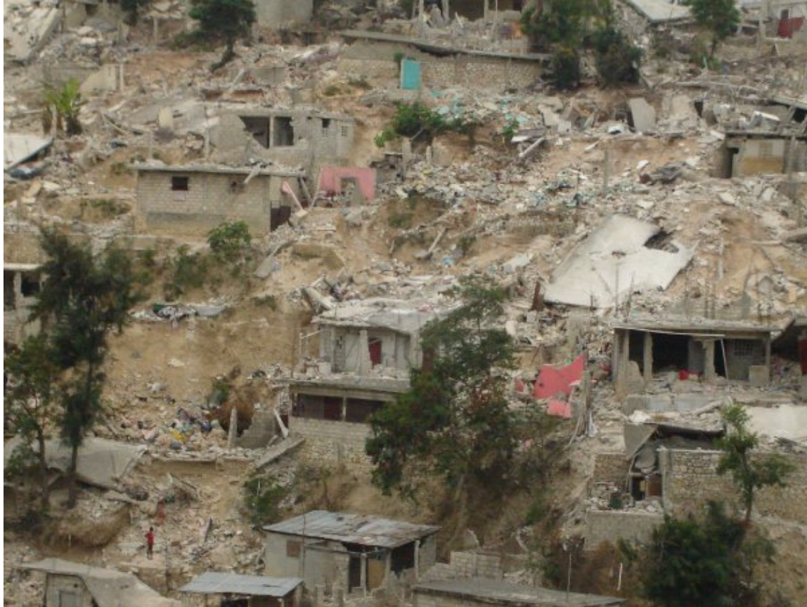
Houses built on the hills slid down...