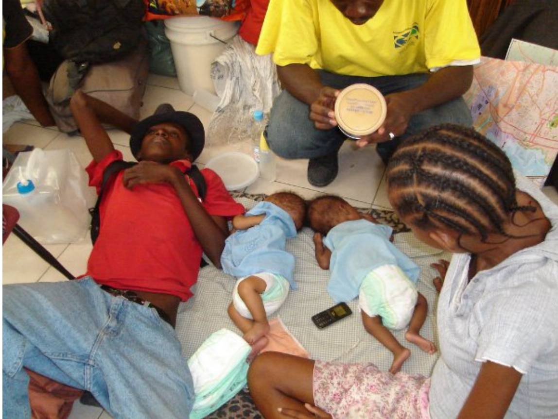
Cramped Living for a Family