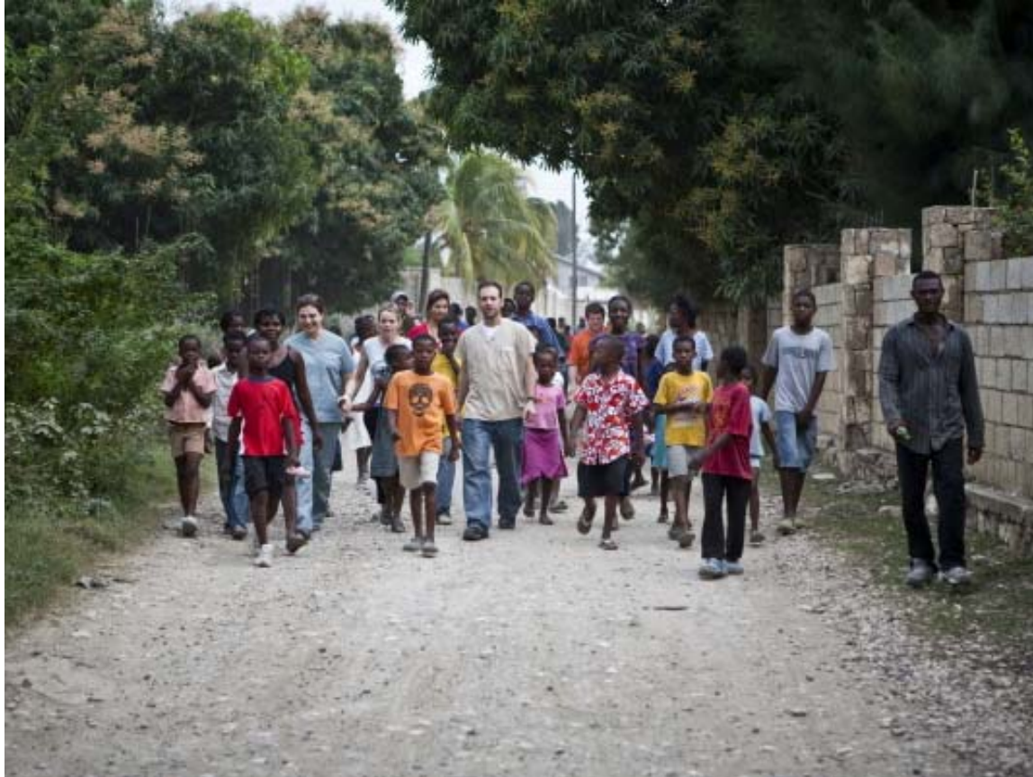
Arrival at Port au Prince